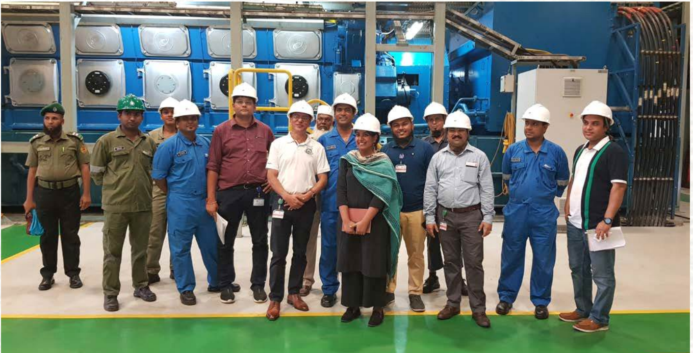
Summit Corporation, Bangladesh