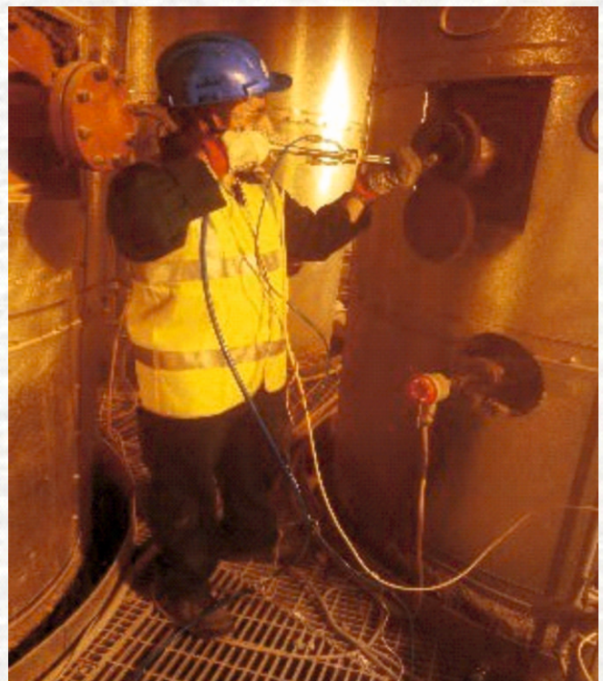
Relative Accuracy Test Audit at a Bio-medical Incineration plant in Qatar