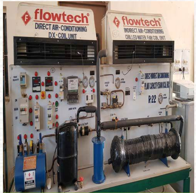
Energy Review GITI Uttarakhand