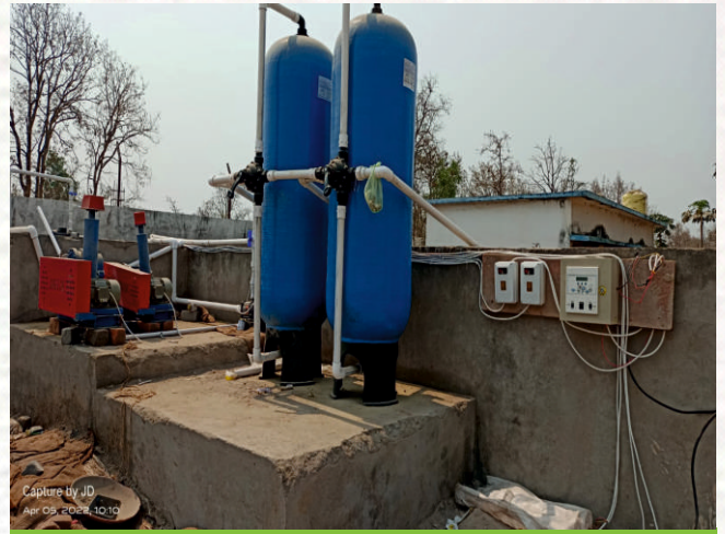
Effluent Treatment Plant with Tertiary Facility